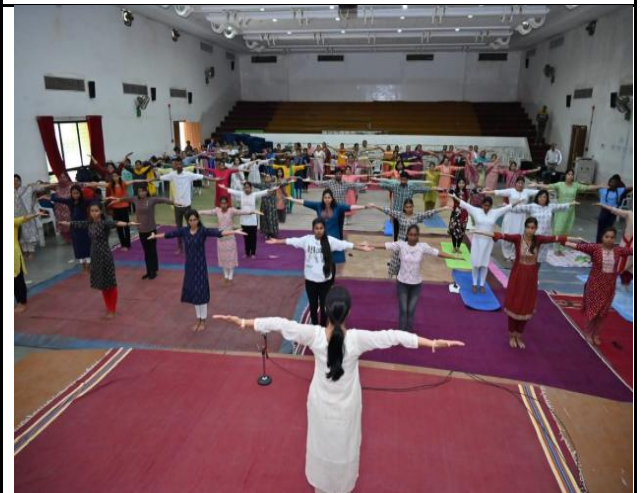
Yoga teachers demonstrating YOGA to the participants