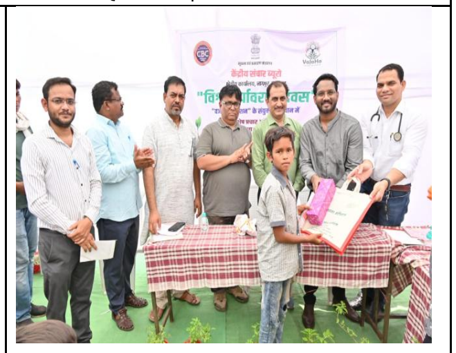
Prize Distribution to the winners of the Quiz Competition