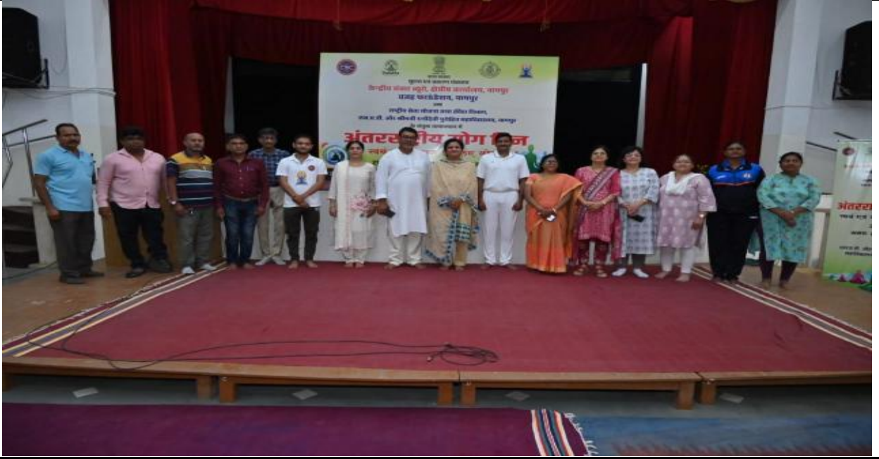
Organizing Team with Resource Persons