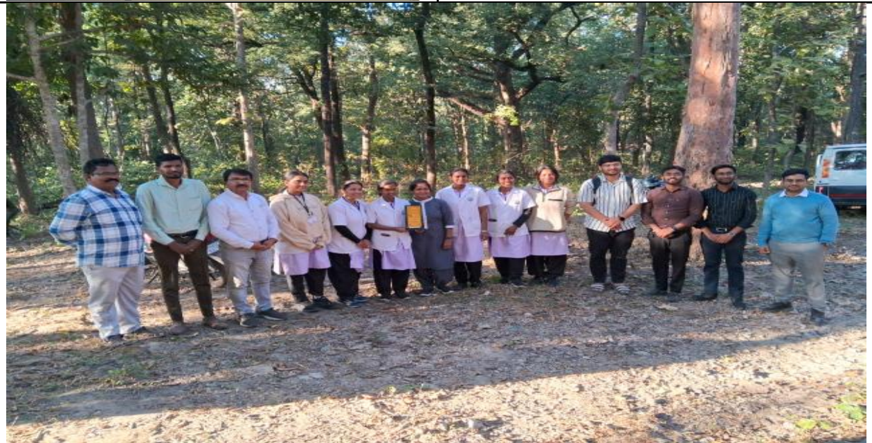
Team of Doctors and Support Staff from SM Medical College and Hospital, Vanadongrari