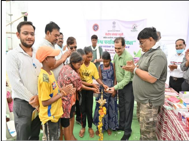
Guests lighting the lamp