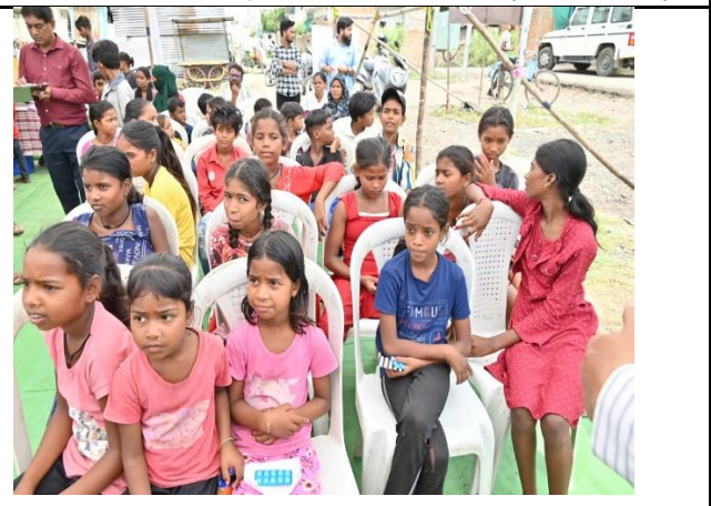
Children in the Basti participating in Quiz Competition on "Environment and Cleanliness"