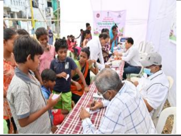
People from the Community getting treated by the doctors