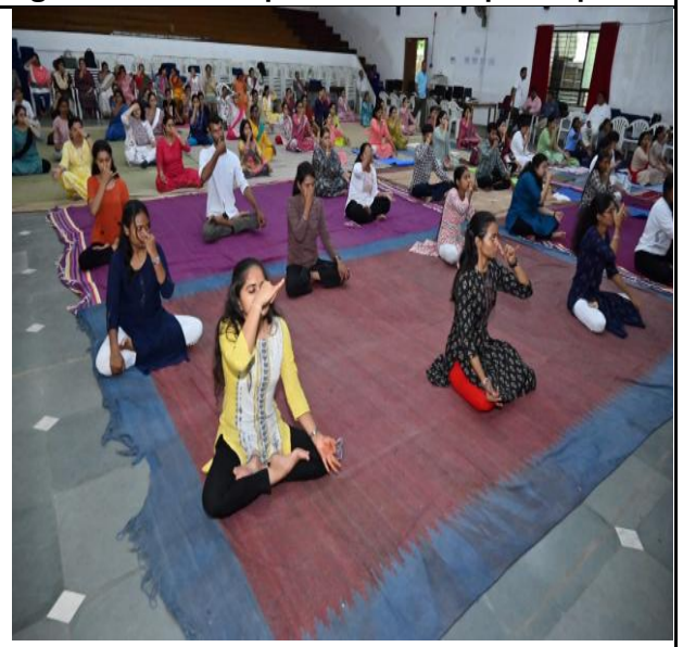
Yoga teachers demonstrating YOGA to the participants