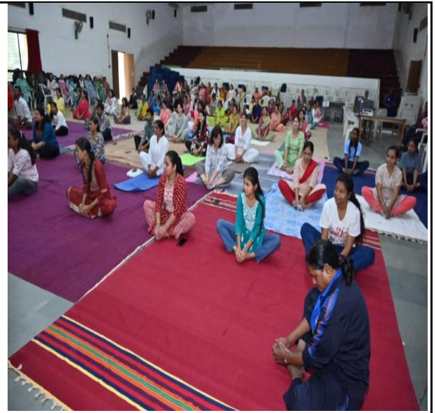
Participants enjoying the YOGA