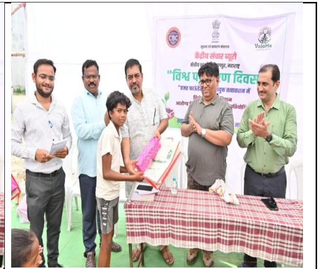
Prize Distribution to the winners of the Quiz Competition